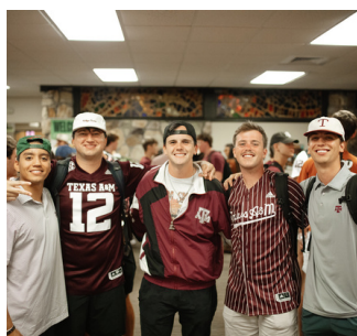
D-GROUP NIGHT & CAMPUS TIME