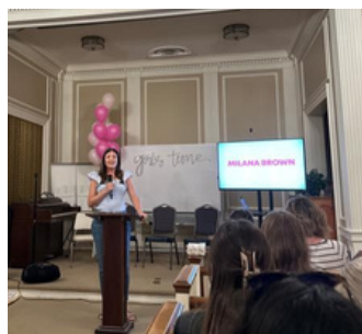
WORLD PRAYER & GIRLS/GUYS TIME