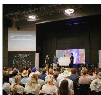
CHURCH & OUTREACH TRAINING